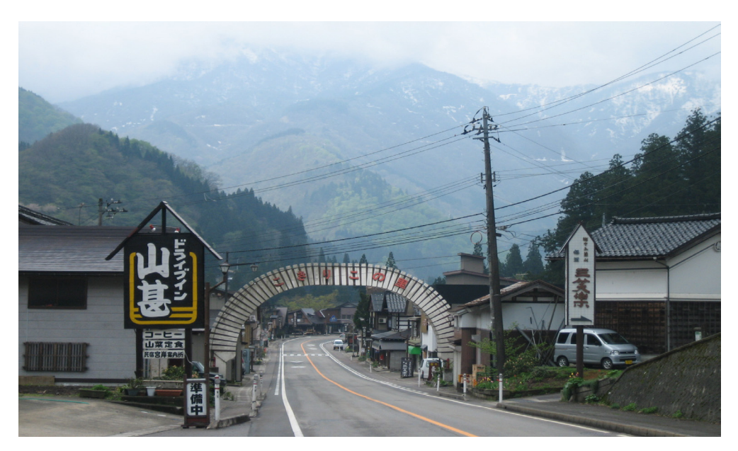
Sliki 1 in 2: Festival Kokiriko prirejajo 25. in 26. septembra. Obiskovalci se preizkusijo v plesu z inštrumentom sasara .