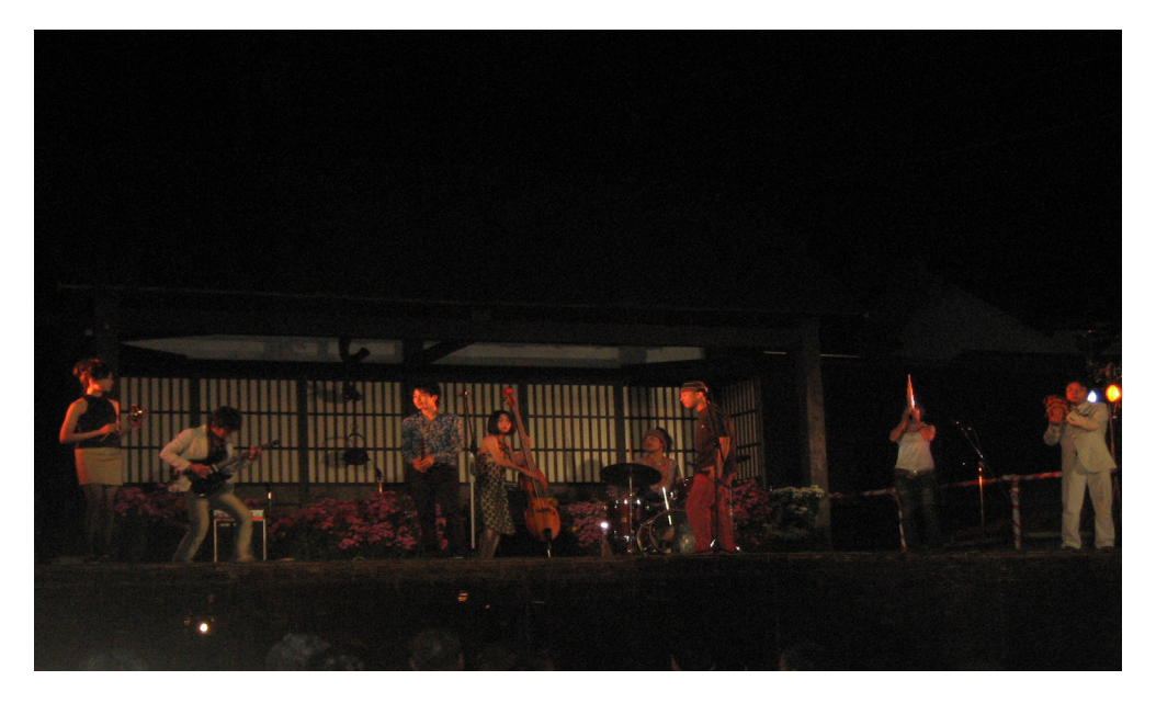
Slike 3, 4 in 5: Kagura mai se med festivalom Kokiriko izvaja dvakrat: ob daritvi v svetišču Hakusangu in na odru med večerno predstavo.