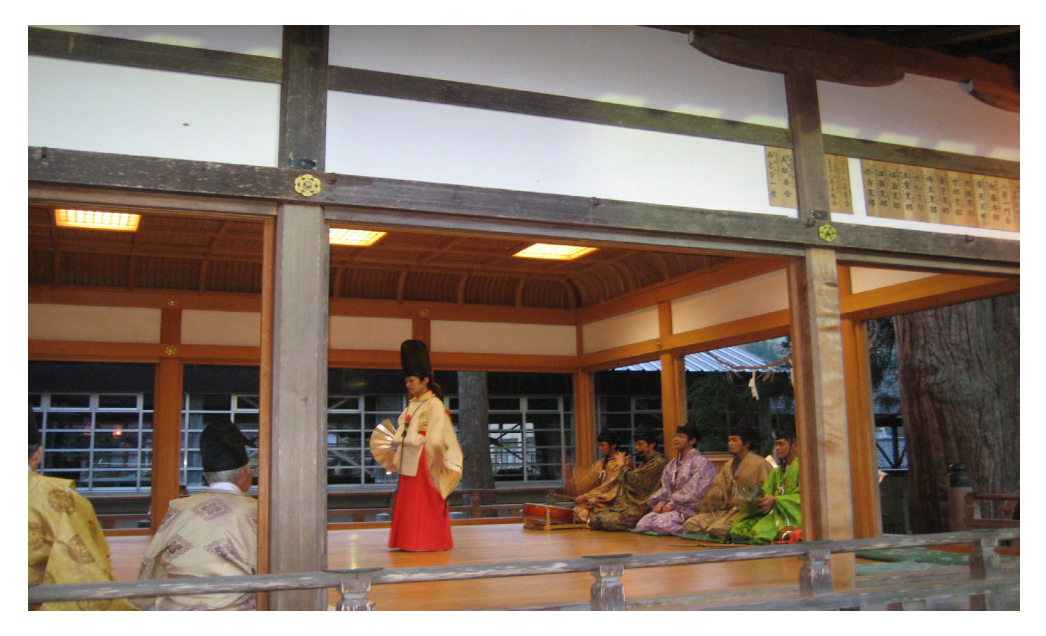
Slike 6–12: Pomladanski festival: po koncu levjega plesa shishi mai in procesije, s katero se daritev prinese v svetišče Hakusangu, se Kaguro mai izvede v svetišču; občinstvo sestavljajo lokalni ljudje.