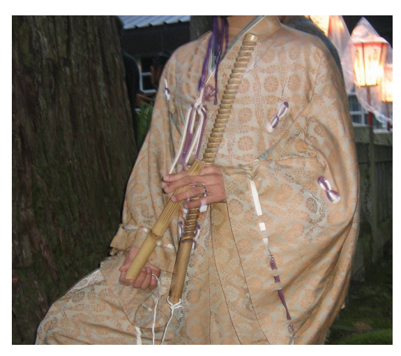
Slika 13: Upoštevajoč legendo, po kateri so rojstni kraj Kagure mai poselili pobegli bojevniki klana Taira, je združenje Kokiriko uta hozonkai privzelo kostume v slogu 12. stoletja. Na fotografiji zgoraj (slika 12) lahko vidimo običajni razpored glasbil, od leve proti desni: taiko , shinobue , pevec, nato pa sledita bōzasara in dōbyōshi . Na fotografiji je izvajalec na glasbilu bōzasara ali surizasara .